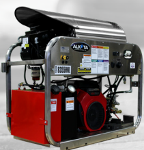
Honda Engine Stainless Steel Frame