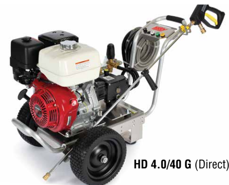
HD 4.0/40 G (Direct)