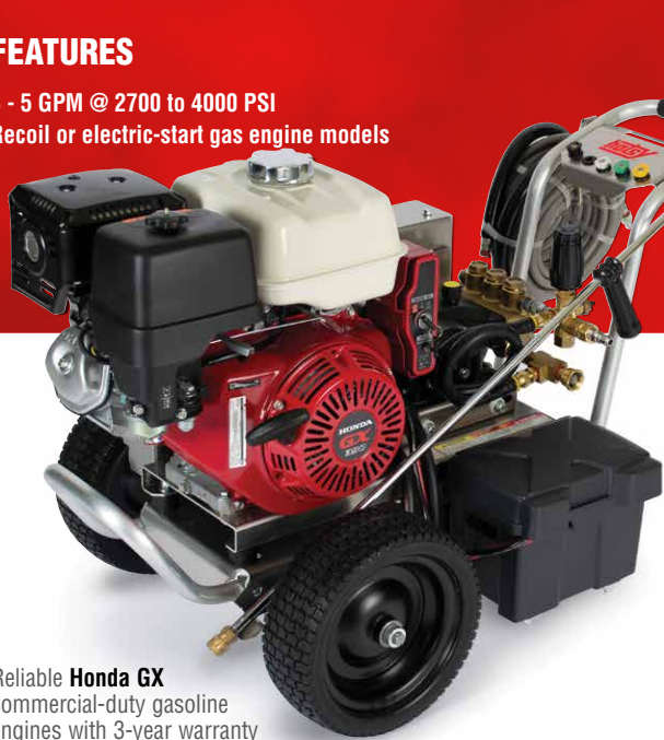
HD 4.0/40 GeB (Belt)

Reliable Honda GX commercial-duty gasoline engines with 3-year warranty